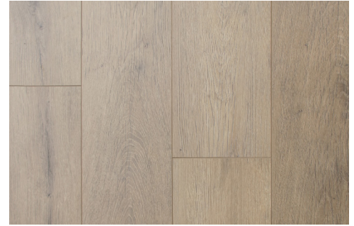
Sidney | DGLA0303