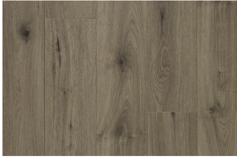
Lakeside | DGLA0301