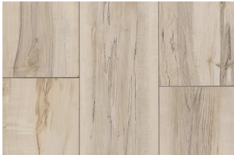
Taholah | DGLA0304