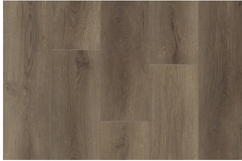
Ozette | DGLA0302