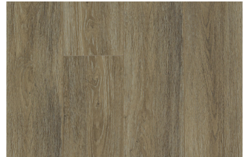
Ilwaco | DGLA0306