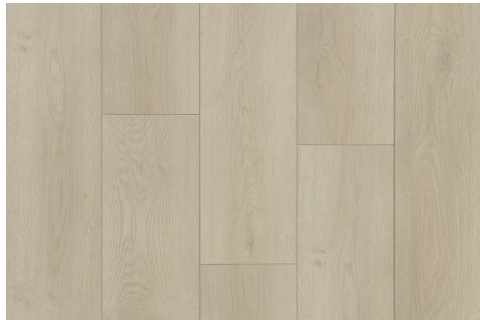
Seabrook | DGLA0305