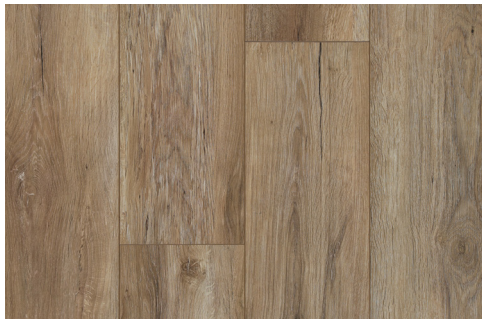
Seaside | DGLA0307