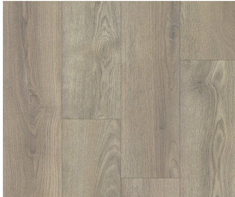
Kingsmill | UM162542217