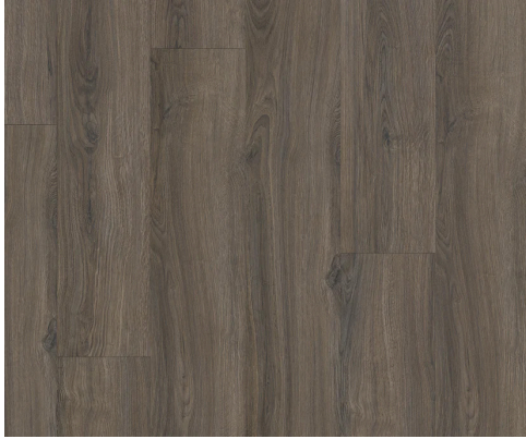
Nova Scotia Oak | UMLI22001