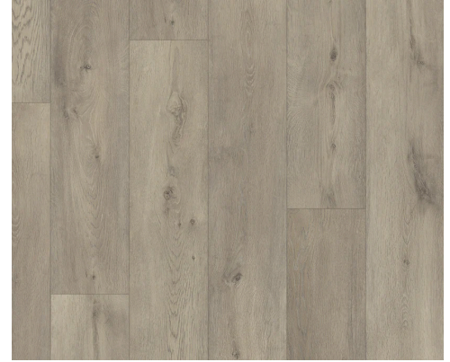
Beaver Creek | UMLI22004