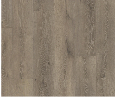
Keystone | UMLI22003