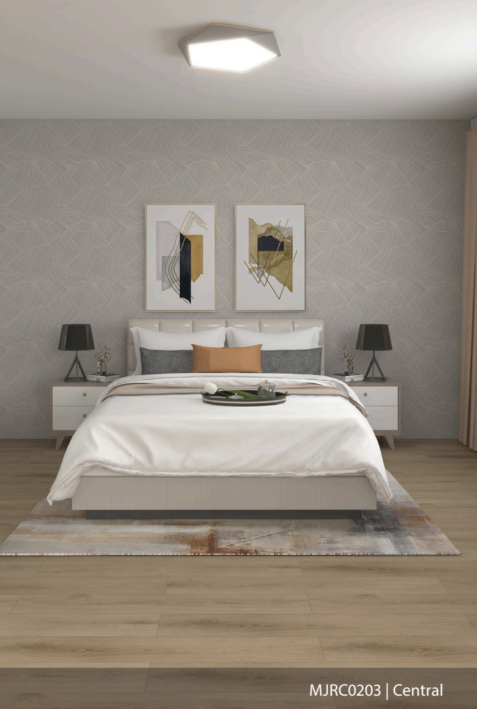
MJRC0203 | Central