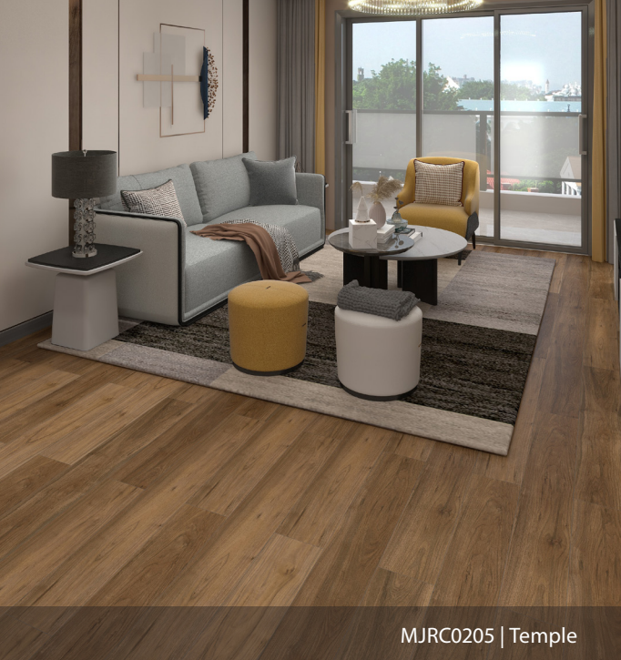
MJRC0205 | Temple