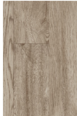
ARJ7208641 Elmshorn 6" x 48"