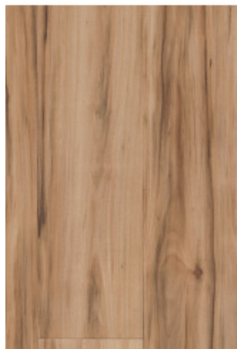
ARJ7209641 Saga 6" x 48"