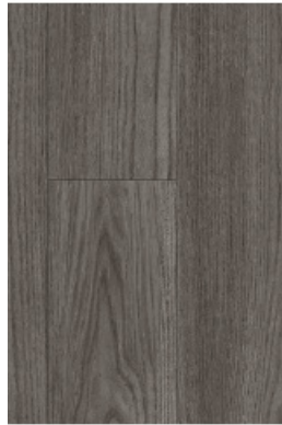
ARJ7206611 Halden 6" x 36"