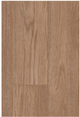
ARJ7205611 Artek 6" x 36"