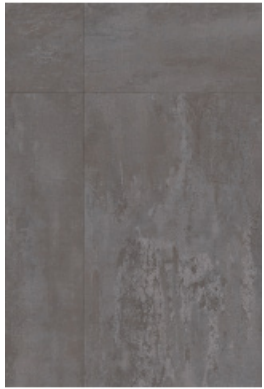
ARJ7201821 Norse 18" x 18"