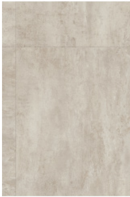
ARJ7202821 Fjord 18" x 18"