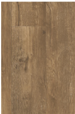
ARJ7210641 Dynt 6" x 48"