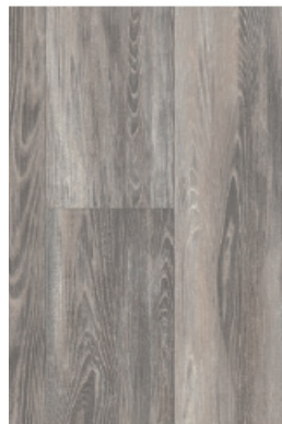
ARJ7212641 Odense 6" x 48"