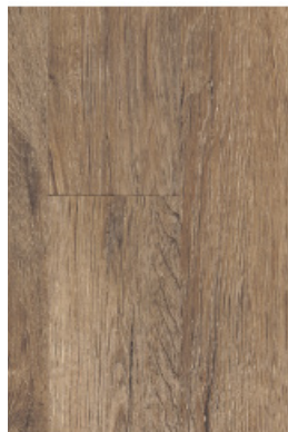
ARJ7211641 Solvang 6" x 48"