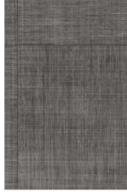
ARJ7204821 Ekelund 18" x 18"