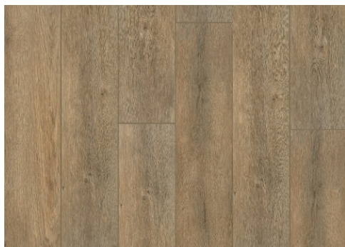
Peninsula Heights DGRC0304P