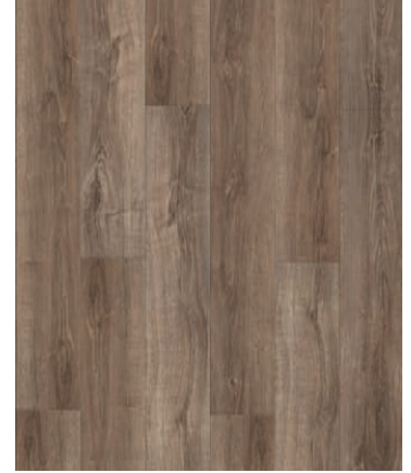
WEATHERED OAK CHAUFOUNSPC1862