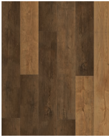
ROASTED HONEY* CHAUFOUNSPC2530