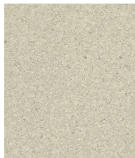
Natural White ARH5311271