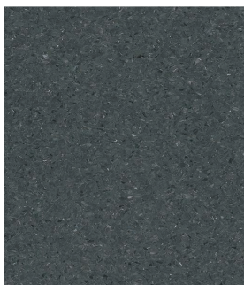
Almost Black ARH5303271