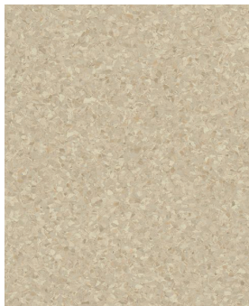
Brushed Sand AR84970271