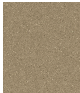
Sand Mid ARH5320271