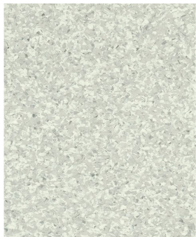
Silver Gray AR84197271