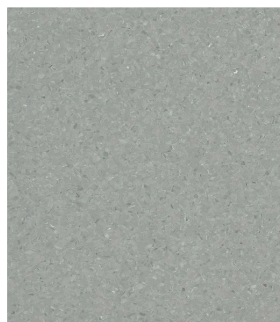
Gray Light ARH5301271