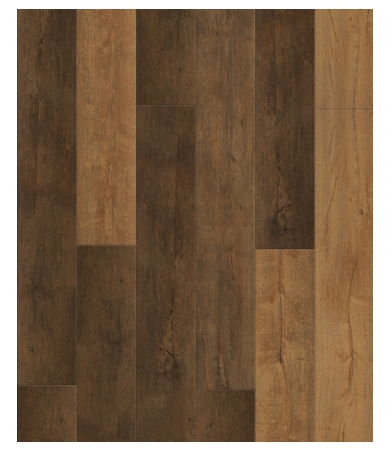
ROASTED HONEY* CHAUFOUNSPC2530