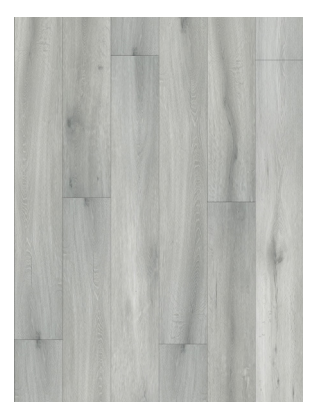
MISTY MEADOW CHAUHARMSPC2360