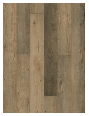
CHESTNUT GROVE* CHAUHARMSPC2611

Misty Meadow, Beech, Orchard, Nightingale, Chestnut Grove