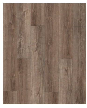
WEATHERED OAK CHAUFOUNSPC1862