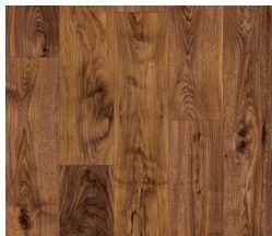
HEARTLAND WALNUT IH53457