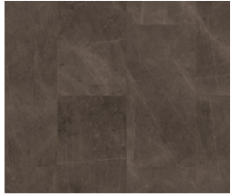
CENTENNIAL SANDSTONE IH53468