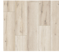
FOREST GROVE IH53461