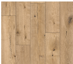
TRIMBLE WHITE IH53458