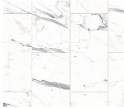
REPOSADO CARRARA IH53464