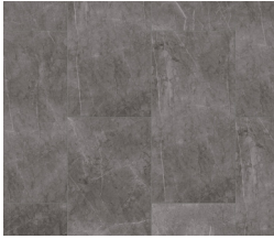
SESAME SANDSTONE IH53465