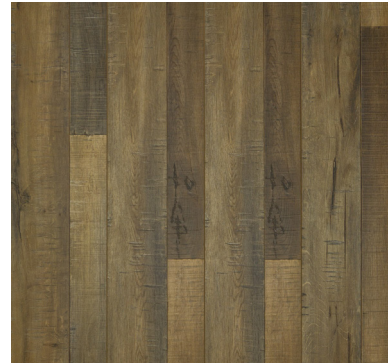
Rocky Mountain MGLA0202