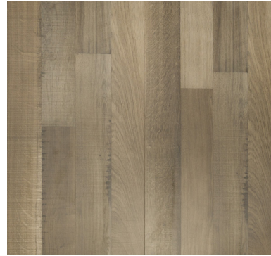
Maroon Bells MGLA0205