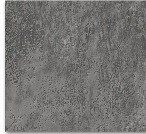
Seattle Storm - ARG48182