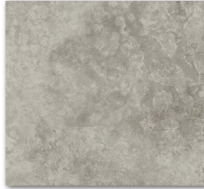
Pebble Stone - ARG28172