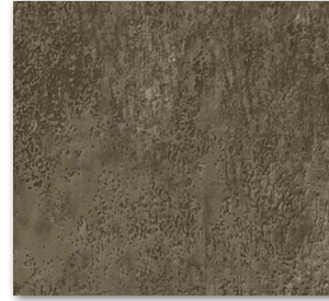
Espresso Brown - ARG48172