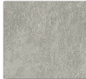
Kingston Fog - ARG48152