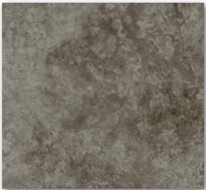
Anchor Gray - ARG28162