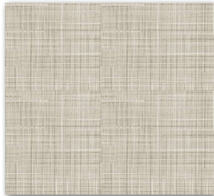
Cafe Cream - ARG28102