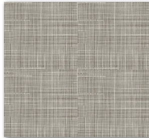
Brown Bay - ARG28112