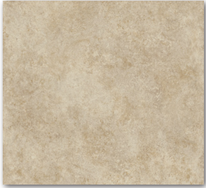
Long Beach - ARG28152