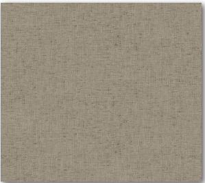
Fusion - ARG48472