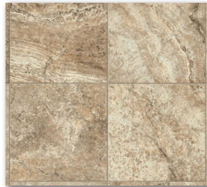
Maiden's Blush - ARG48432