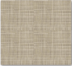
Light Breeze - ARG28122